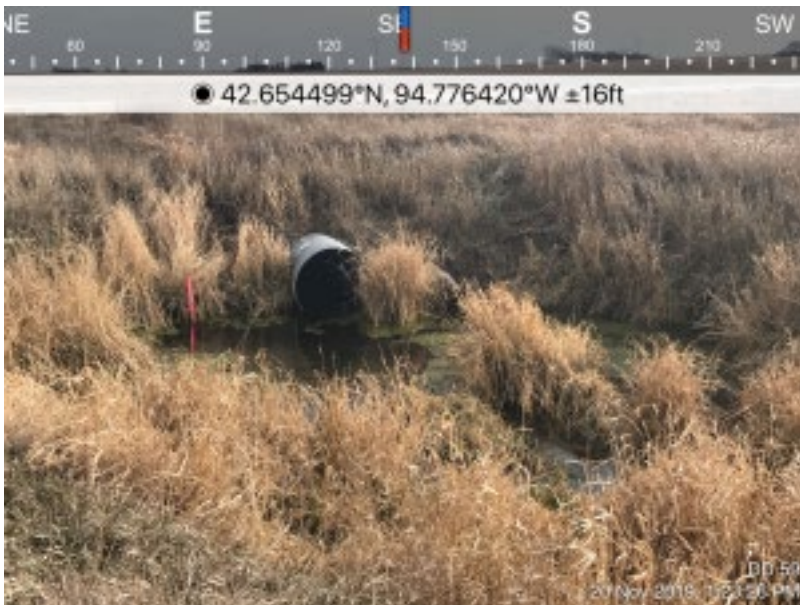
The orange lath is beside the 30" cmp. There is about 8" of water over the 30" cmp.