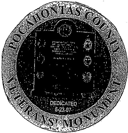
Picture of front of coin