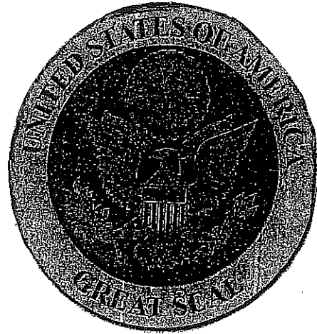
Picture of back of coin